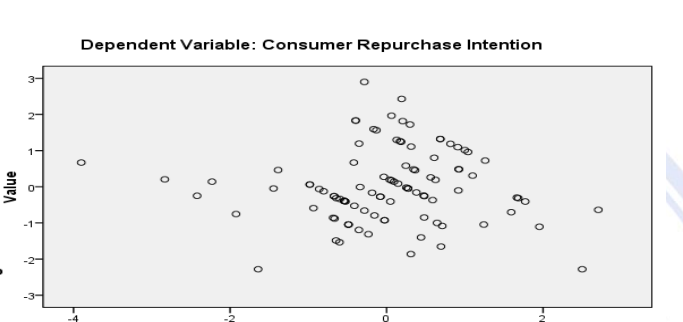
Figure 2. Heteroscedasticity Source: SPSS Output version 22.00, 2019

Figure 2 shows that the dots is not created a specific pattern and also spread above and below 0 (zero). It proves that there is no heteroscedasticity in this regression model.