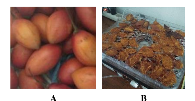
Figure 1. A) Fresh tamarillo fruits; B) Dried tamarillo.fruits

its effect toward the concentrations of PGE-2, IL-1 \beta , and TNF- \alpha . Figure 1 A and B showed the fresh tamarillo fruits as well as dried tamarillo fruits.