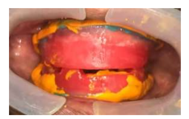
Figure 5. Closed mouth impression

In follow-up, the patient controls were performed at 1x24 hours post denture insertion, then day 3 and day 7. The patient was satisfied because the denture was not shaking and fit well when talking or chewing food.