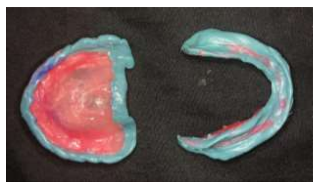
Figure 4. Border molding on closed mouth technique