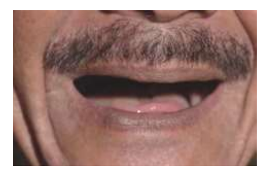
Figure 9. Before and after denture insertion