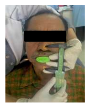
Figure 1. Impression using centic tray

A 60-year-old male patient reported to the Department of Prosthodontics, Airlangga University, with chief complaints of difficulty in mastication, loose upper and lower dentures, and poor esthetics. He also complained of denture moving during swallowing and speaking. Clinical examination revealed that the patient had no gross facial asymmetry. The temporomandibular joint (TMJ), muscles of mastication and facial expression were asymptomatic. No gross abnormalities were detected in the overall soft tissues of the lips, cheeks, tongue, and oral mucosa (Figure 1).