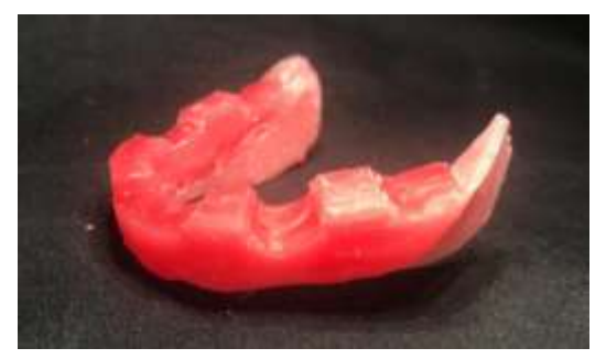
Figure 3. Making pillars on mandibular bite rim

In closed mouth technique, the first thing that needed to be done was border mould using monophase. Patient was instructed to move masticatory muscle by pronouncing letter "U" and "E", and then for maxilla, patient was instructed to say "AHA" loudly and followed by swallowing movement. On mandibule, impression was being done by sticking the tongue out forward and to left and right, followed by sucking movement and swallowing saliva (Figure 4).