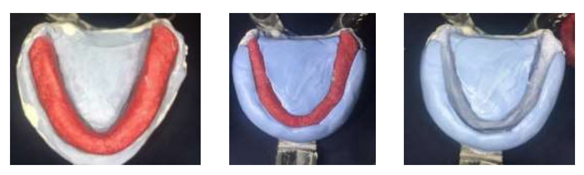
Figure 8. Putty index made after impression of neutral zone