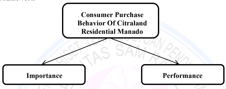
Figure 1. Conceptual Framework

This research is conducted to see the importance and performance of Consumer Purchase Behavior Of Citraland Residential Manado.