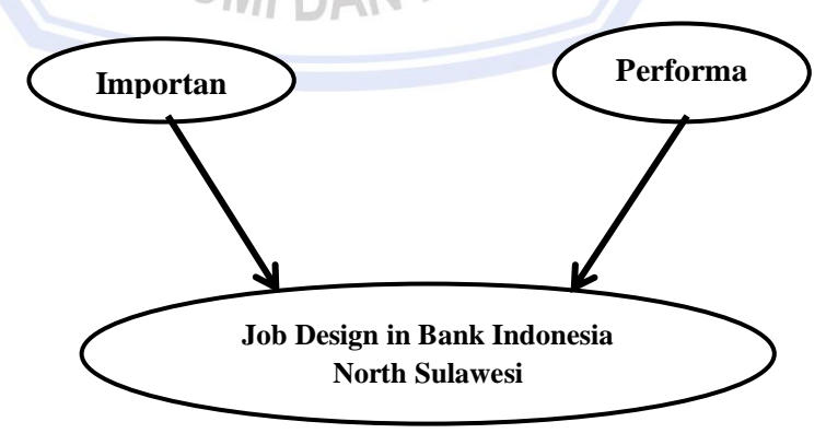
Figure 1. Conceptual Framework