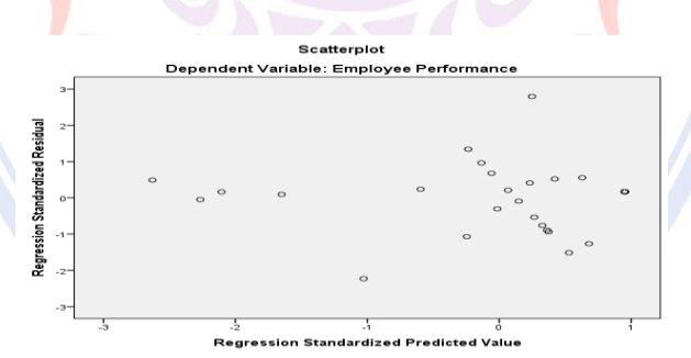
Figure 2. Heteroscedasticity Test Result