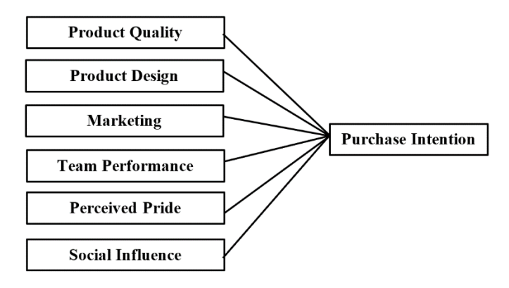
Figure 1. Theoretical Framework