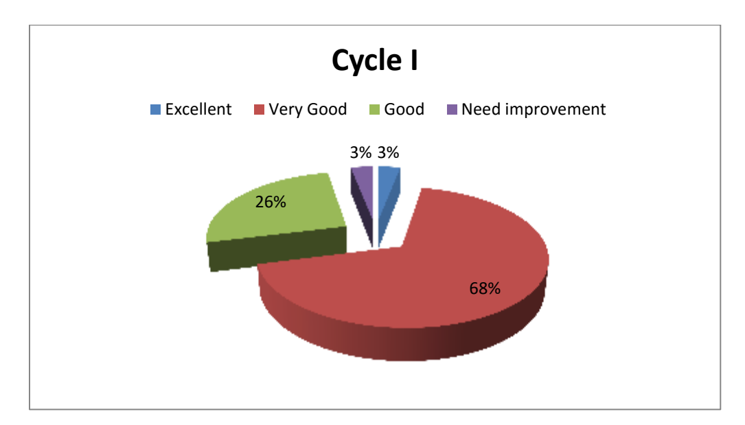
b. Cycle I

From the result above, it can be seen that the students really need some improvement in oral competency. The data shows that no one in excellent category or 0%, 45% are very good, 45% are good and there are 10% students who need some improvements. Based on the result above, the researcher concluded that students need more improvement in their oral competency and decided to do more action to improve their oral competency better.