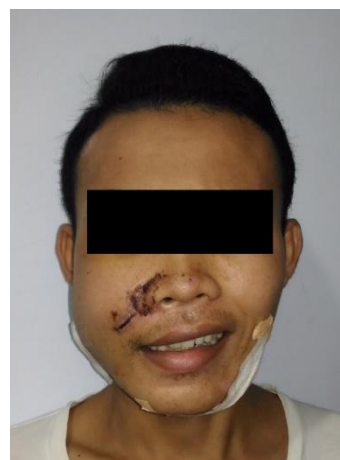
Figure 5B. Post-operative day 7