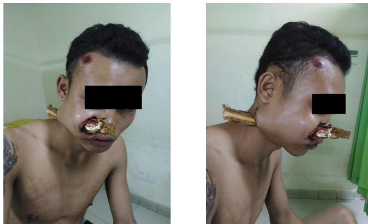
Figure 1. Preoperative anterior dan lateral views