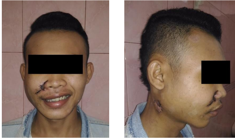
Figure 5C. Post-operative day 14, anterior and lateral views