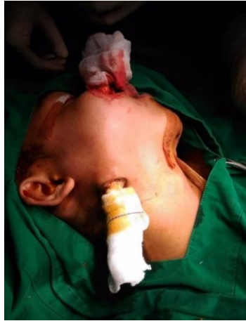
Figure 3A. Supine position with head slightly turned to the left