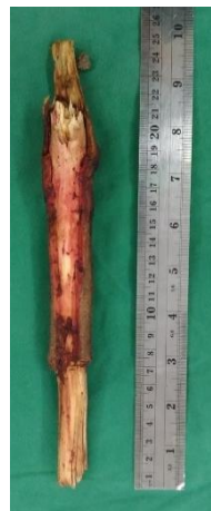
Figure 4. Piece of the tree branch after removal, (length 25 cm, diameter approximately 4 cm)