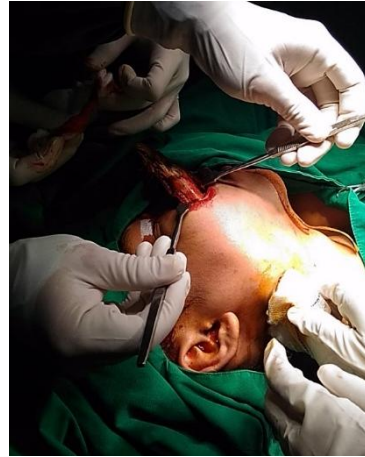
Figure 3B. Removal of the tree branch back along the path of insertion