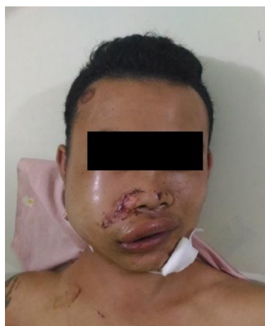
Figure 5A. Post-operative day 1