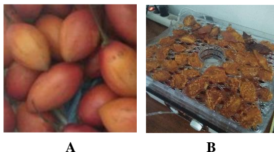
Figure 1. A) Fresh tamarillo fruits; B) Dried tamarillo fruits

its effect toward the concentrations of PGE-2, IL-1 \beta , and TNF- \alpha . Figure 1 A and B showed the fresh tamarillo fruits as well as dried tamarillo fruits.