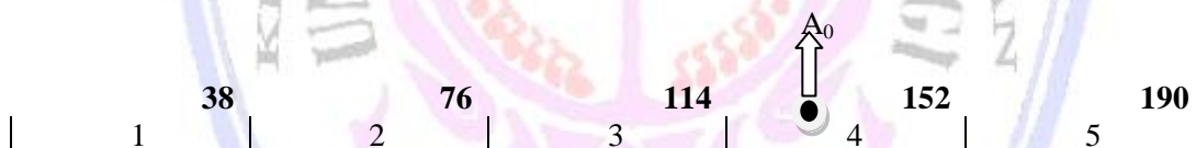
Figure 2. Level of Attitude

Table 2 shows the maximum score of attitude where the ideal belief is five (5). If the ideal belief substituted with four, three, two, and one, it resulted in maximum scores until minimum scores. So the score from maximum to minimum is 190; 152; 114; 76; 38. So, five (5) is the score of very good and one (1) as very bad, the maximum score of attitude is 190 and the minimum score of attitude is 38. As the result above it shows that the consumer attitude of made-in China products is 120.60. The score above said that consumer attitude towards made-in China products is in good level. It means that consumer attitude of made-in China products can be considered as good.