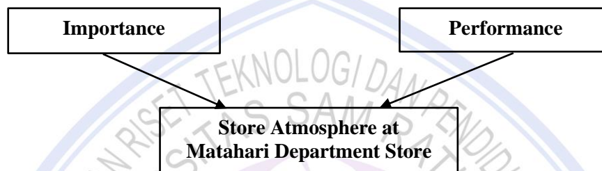
Figure 1. Conceptual Framework