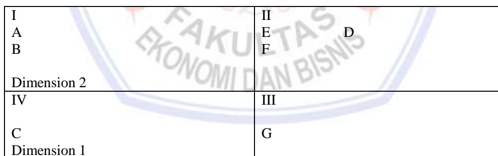
Figure 2. Conceptual Framework

Analysis of Multi Dimensional Scaling (MDS) is a technique that can be used multiple variables to determine the position of other objects based on similarity assessment. MDS is also called the perceptual Map. MDS associated with Map-making to describe the position of an object with other objects based on the similarity of these objects.