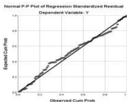
Figure 2. Normality Test