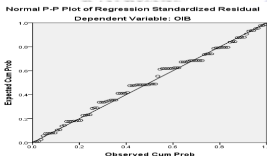
Figure 3. Normality Results