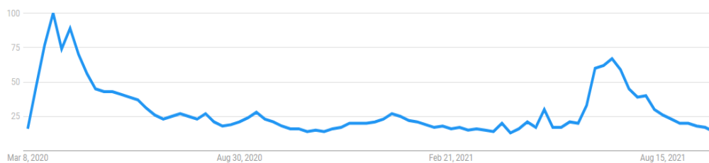
Keyword 2: "vaccine+ stage 1 / stage 2 + dose 1 + az seneca + pfiser + sinovac + sinopharm + moderna"