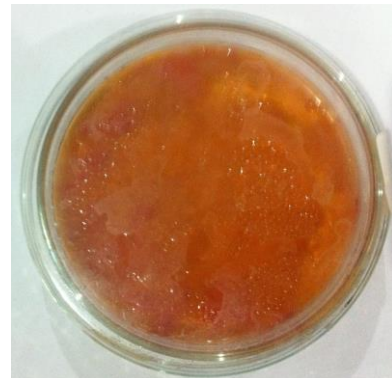
Figure 1. Bacterial growth on MacConkey medium with 3% diesel oil + 0.9 % salt

Bacteria which grew on nutrient agar (NA) with 1-5 % diesel oil (with or without salt) were transferred into MacConkey agar with 3% diesel oil + 0.9% salt. MacConkey agar is based on the bile salt-neutral red-lactose agar developed by MacConkey, and it is recommended for detection and isolation of Gram-negative bacteria. During fermentation of lactose, local pH dropped around the colony causing a color change to neutral red and followed by bile precipitation. Bile salts mixture and crystal violet inhibited Gram-positive cocci, thus serves as selective agents that only allows Gram-negative bacteria to grow (Figure 1). The bacteria grew on this medium was picked individually and grown on KIA slant media.