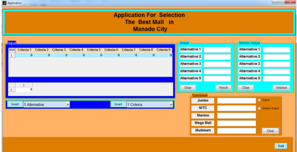
Figure 3. Application Without User Guidelines

The result of making GUI based application system that can be seen in figure (3), figure (3) is result of application design without user guidelines, while for figure (4) is result of train user. In this user train the input data used is limited to 5 data, the reason is because the coding is made only up to 5 data.