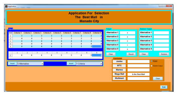
Figure 4. Application Train User

From train user application (after running) the result of GUI based application calculation is same with manual calculation result that yield result that Mega Mall is the best mall in Manado city.