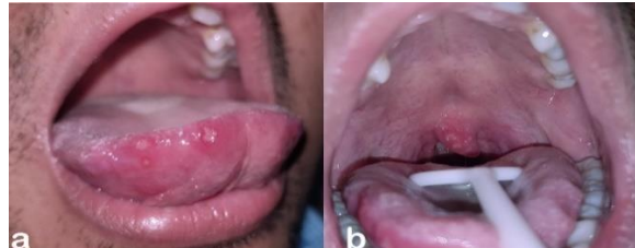
Figure 1. First visit, multiple ulcers on the tongue (a) and pharynx (b)

increase the dose of acyclovir to 500 mg 5 times a day. Acyclovir is usually effective to treat herpes simplex virus. 8 However, despite increasing the dose of acyclovir, the patient still got new lesions.