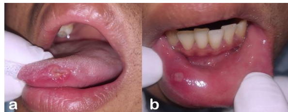
Figure 3. Third visit, ulcer on the left lateral tongue (a) had not yet healed, and a new ulcer appeared on the lower lip mucosa (b)