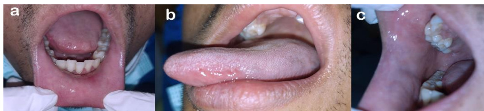
Figure 3. Fifth visit, after using valacyclovir, there were no lesions on the lower labial mucosa (a), left lateral tongue (b), and right buccal mucosa (c)