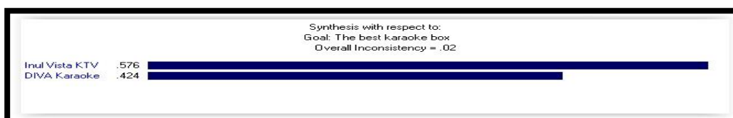
Figure 2. Result of Best Karaoke Service