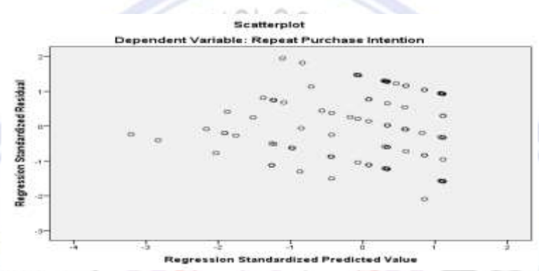
Figure 2. Heteroscedasticity

Based on figure 2, it can be seen that the scatterplots graph above shows the points spread randomly, also spread above and below the number 0 on the Y-axis. It can be concluded that there is no heteroscedasticity in the regression model.