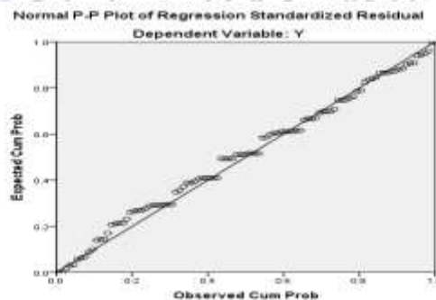
Figure 2 Graph of Normal Probability Plots

In the data above, it can be seen that the output data shows that consumer loyalty data (Y) Asympsig value is 0,067, halal label (X1) Asymp.sig value is 0,412, product quality variable (X2) Asymp.sig value is 0,152 and price (X3) Asymp.sig value is 0,511. Because the four variables are more than 0,05, it can be stated that the data distribution is normal. The output of the normality test with the P-P Plot graph is as follows: