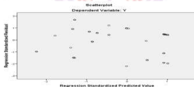
Figure 3 Scaterplot

The table above can be seen that the significance value of the X1 variable is 0.564, the X2 variable is 0.303 and X3 is 0.194. Because the significance value is more of 0.05, it can be concluded that the regression model does not have heteroscedasticity problems. While the output of the heteroscedasticity test with a scatterplot is shown in the image below.