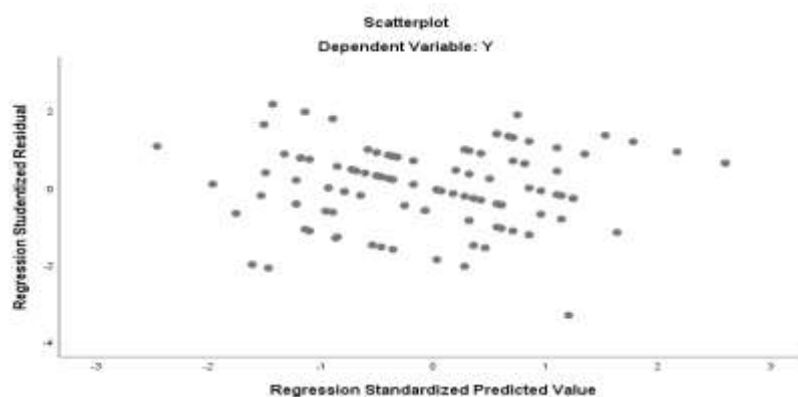
Figure 3. Heteroscedasticity Test