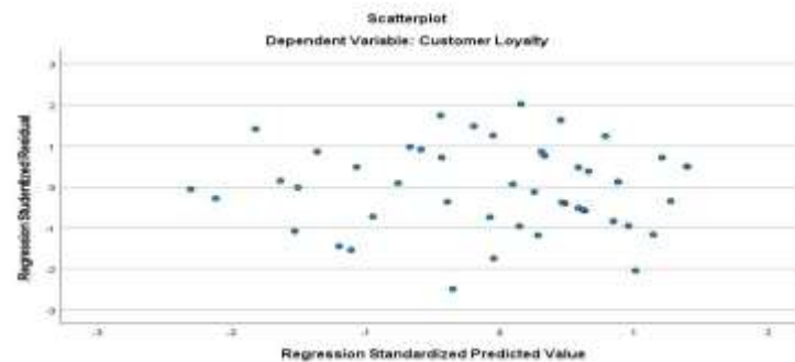
Figure 3. Heteroscedasticity Test Result