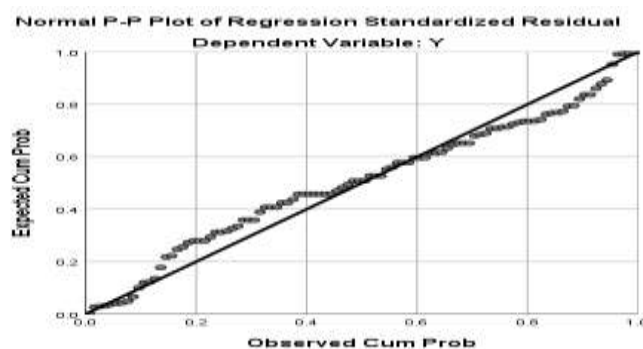
Figure 2. Normality Test