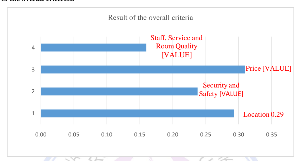
Figure 1. Result of the overall criteria