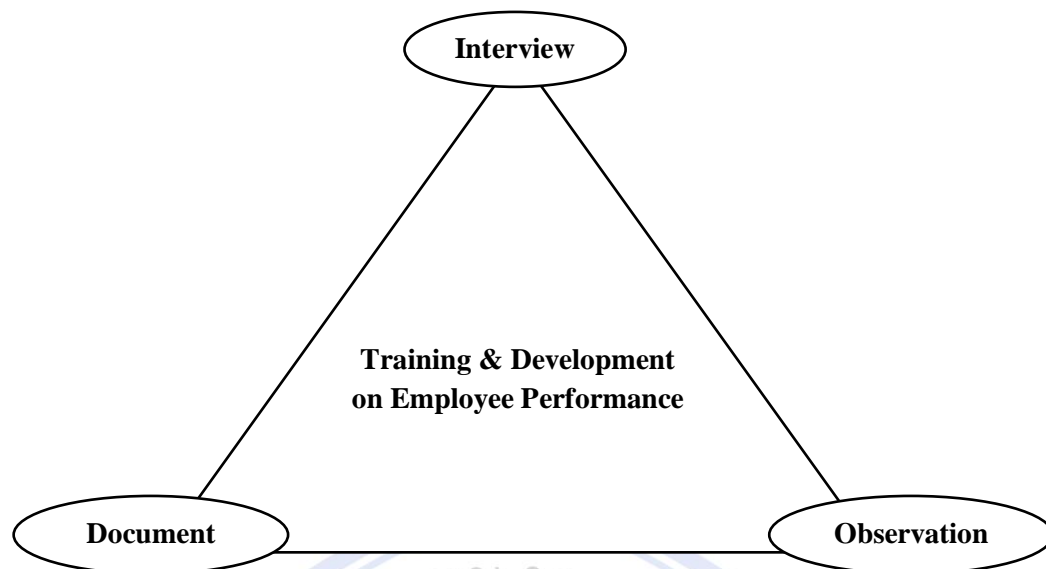
Figure 2. Triangulation Method