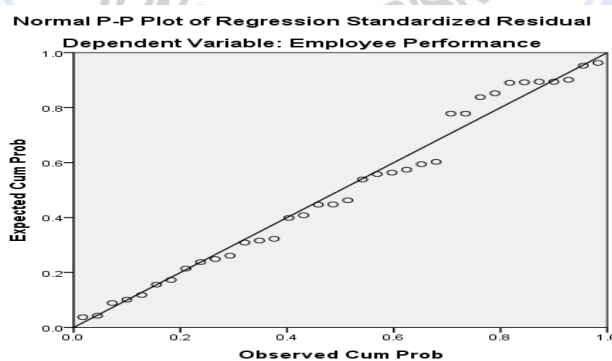
Figure 3. Normality Result