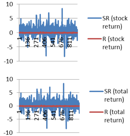
Figure 1. Systematic risk, stock returns, and total returns

Figure 1 describes relationships between systematic risk (SR) and returns (R) where it shows that most of stock returns or total returns still below its market risk which means most of firms are risky in capital market.