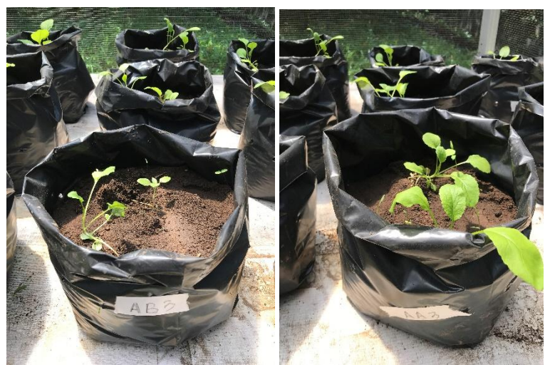
Figure 3. Vegetative Growth Characteristics of Caisin Seed (1 Week After Sowing) with POC and without POC treatment

As a preliminary study, research was conducted on the growth of Caisim ( Brassica rapa L.) planted in polybags with POC treatment and without POC treatment. Significantly, the initial growth of Caisim seeds with POC treatment showed better vegetative morphological characteristics than without POC treatment (Fig. 3). Although further research is needed, several previous studies have proven that the use of POC in vegetable crops has improved soil quality by increasing the nutrients in the soil (Masarimbi et al. , 2010; Taberima et al. , 2010).