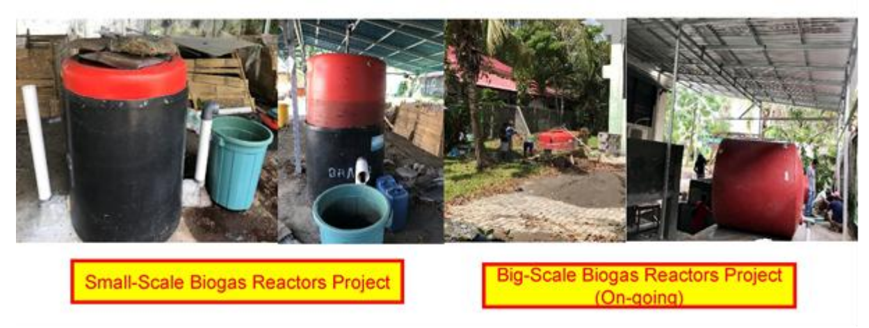
Figure 1: Small-Scale Biogas Reactor Project and Big-Scale Biogas Reactor Project at Sam Ratulangi University Manado

The experimental study was conducted in a batch digester reactor of 60 liters capacity plastic drum at an ambient environmental condition. Before a normal operation, the biogas digester must be started This is done by preparing a 1:1 mixture of cow rumen and water then allowing this to ferment anaerobically for two weeks. The plant's materials were collected from the Faculty of Mathematics and Natural Sciences (FMIPA) and around the Sam Ratulangi University. After entering the rumen material, chopped leaves and water are also put into the biodigester, then monitoring activities for the development of gas production begin to be carried out. The most common type of biogas plant is a Fixed Dome Biodigester, the same type we use in UNSRAT, where the design combines the slurry container and biogas container in a single chamber. As the slurry breaks down, it releases the gas, which rises to the top of the dome and can be piped away to a kitchen stove (Fig. 1).