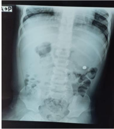
Figure 1. Abdominal X-Ray showed visible foreign body in the stomach.