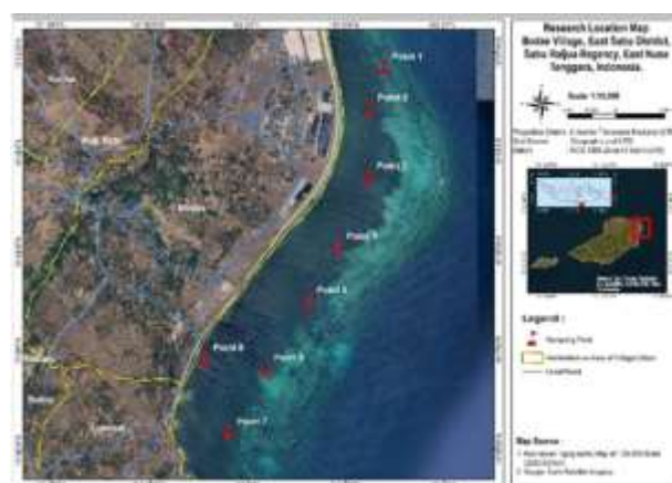
Picture 2. Location Research Map